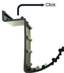
Tracking can be broken off